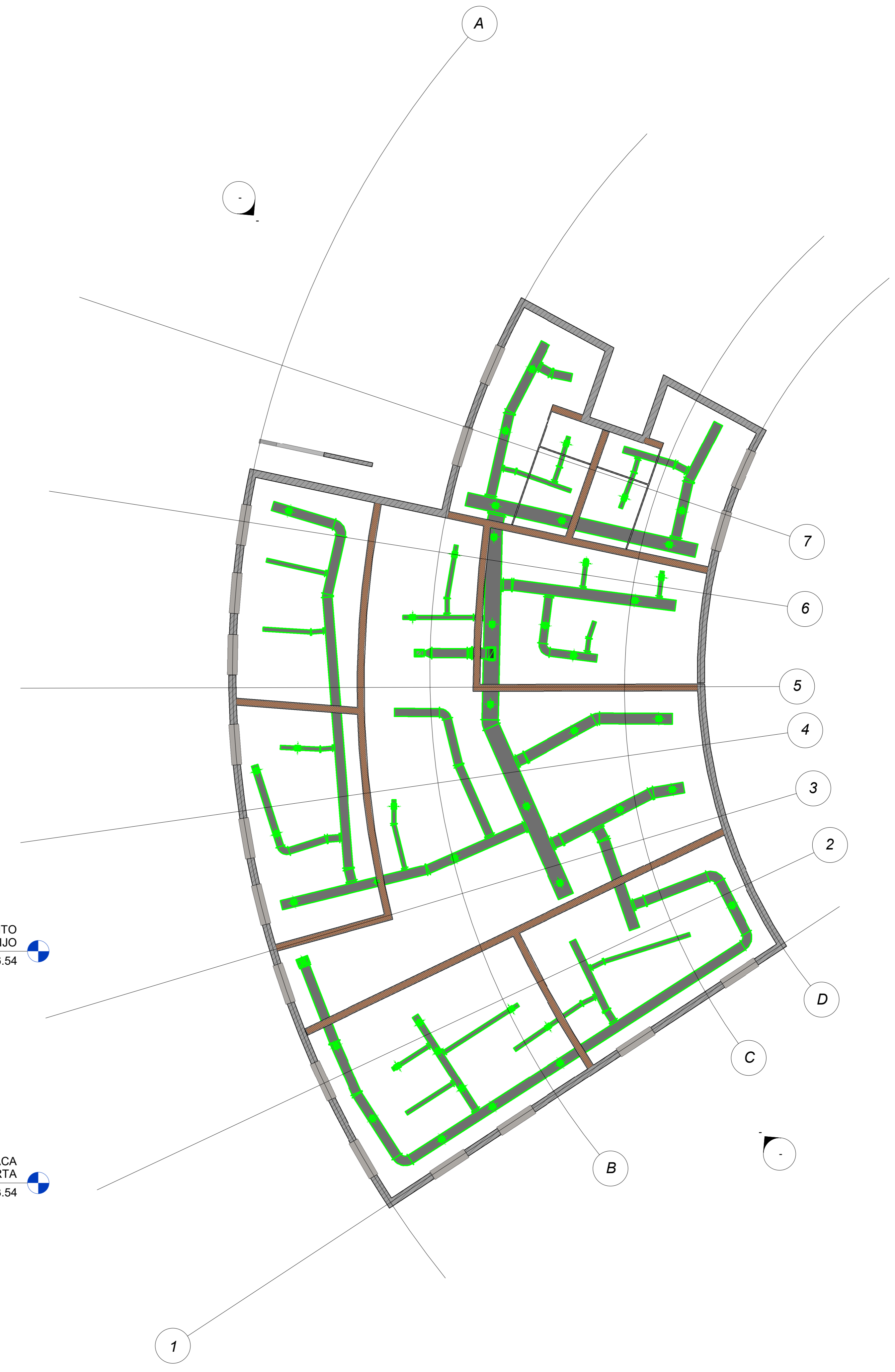
2 01_PRIMER PISO 1:100