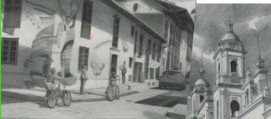
Photo Narratives: a Strategy to Enhance Students' Learning Writing Practices