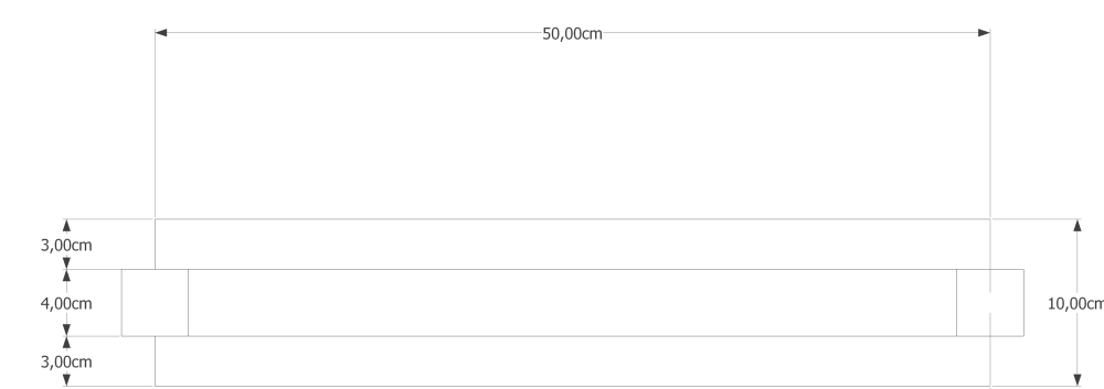
VISTA SUPERIOR ESC 1 : 5