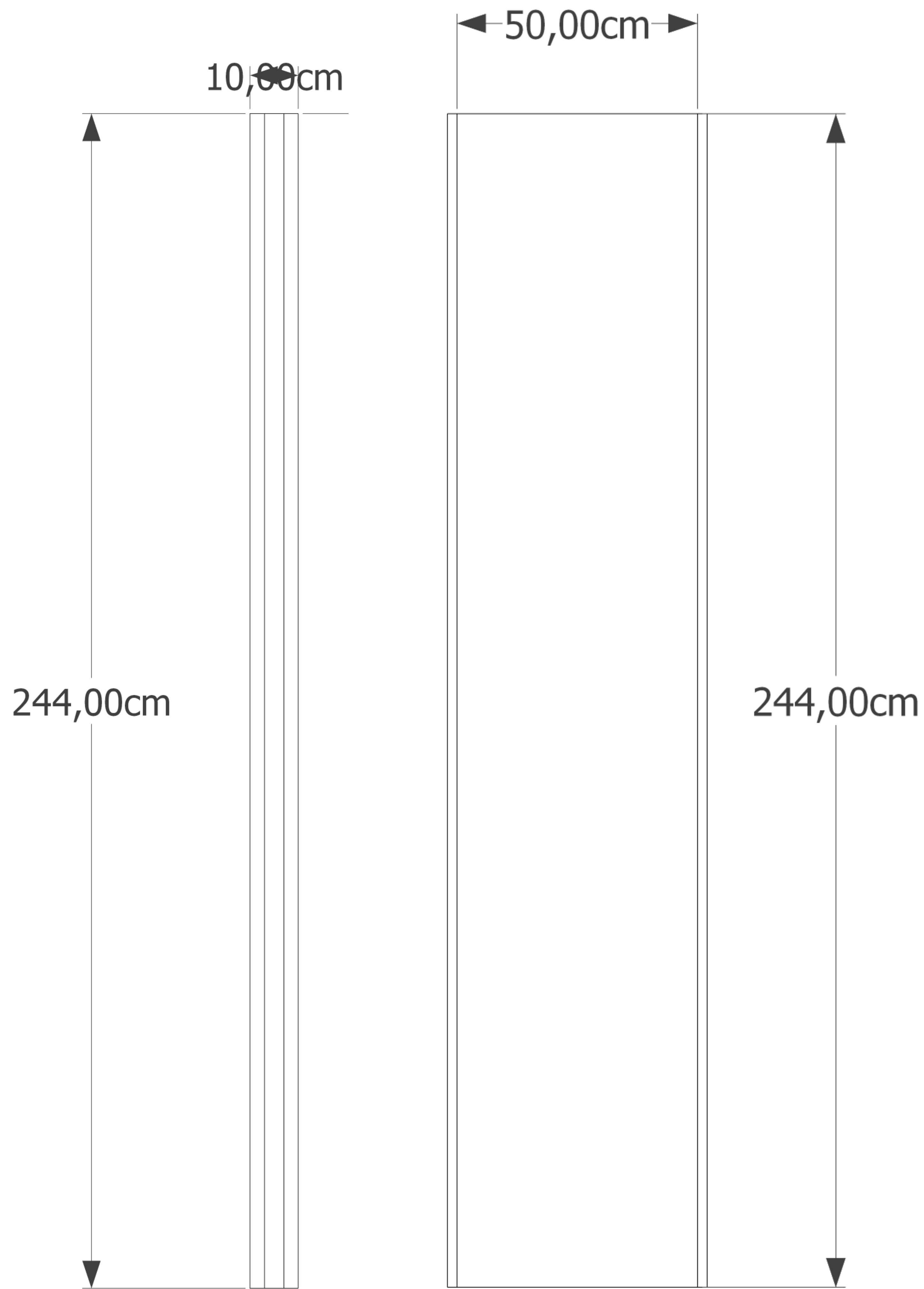
VISTA LATERAL ESC 1 : 5