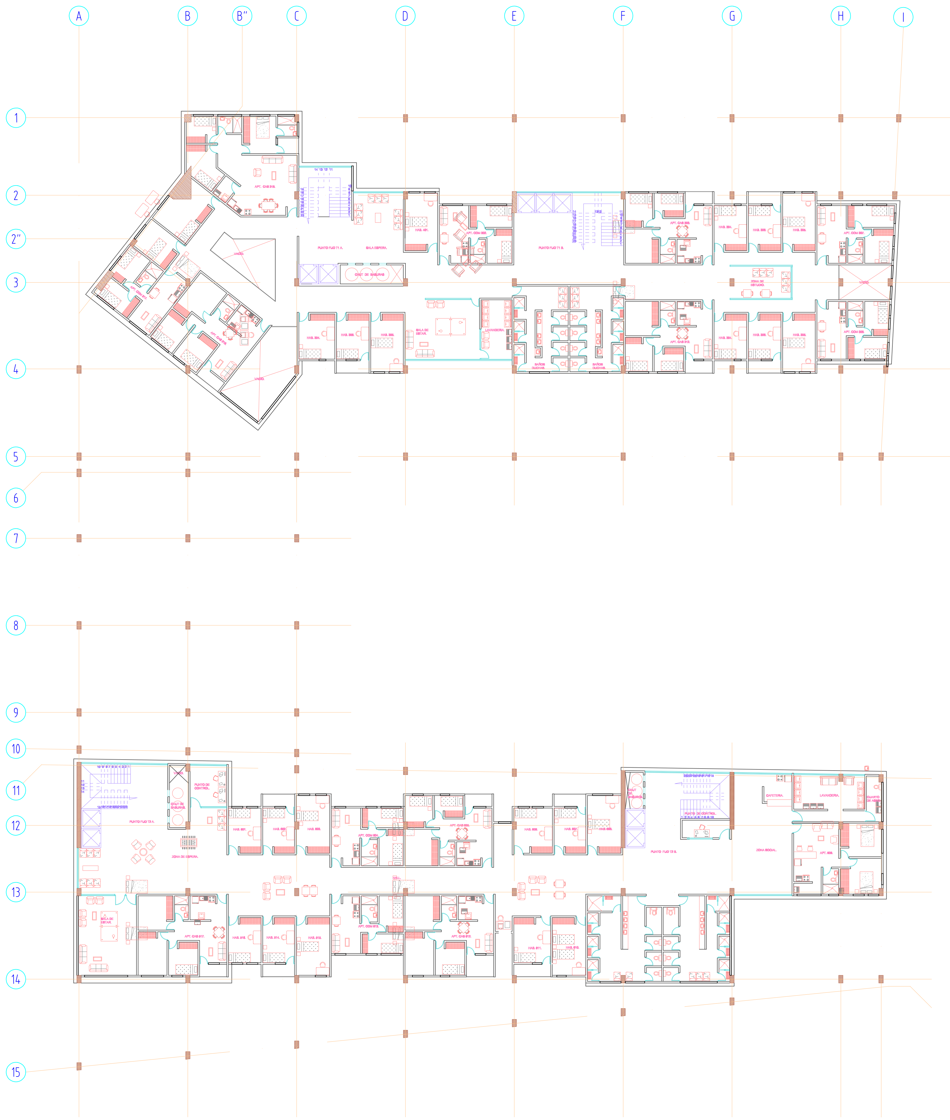
A SEXTA PLANTA ARQUITECTÓNICA ESC: 1000/200